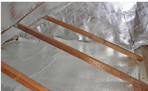
Attic Floor & Tab Insulation

The easy and cost-effective way to reduce energy usage. Simply roll out across the attic floor!