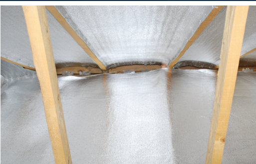
Attic Floor & Tab Insulation

ESP LOW-E® Attic Floor is designed for use in residential attic floor spaces only